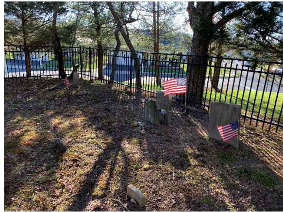
Cook Cemetery at FSSK 2020