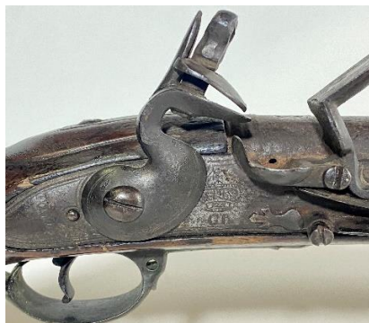
Flintlock Firing Mechanism with Brass Fittings

The barrel lock plate is stamped with GR which is the Royal Armory for Georgius Rex. (King George).