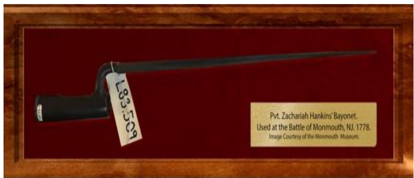
Bayonet, English-type with triangular blade.