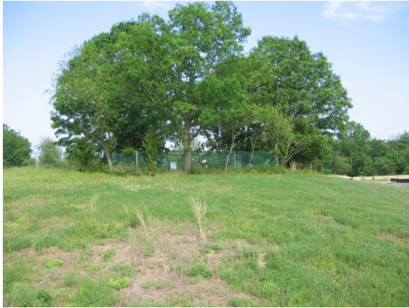
Cook Cemetery prior to FSSK