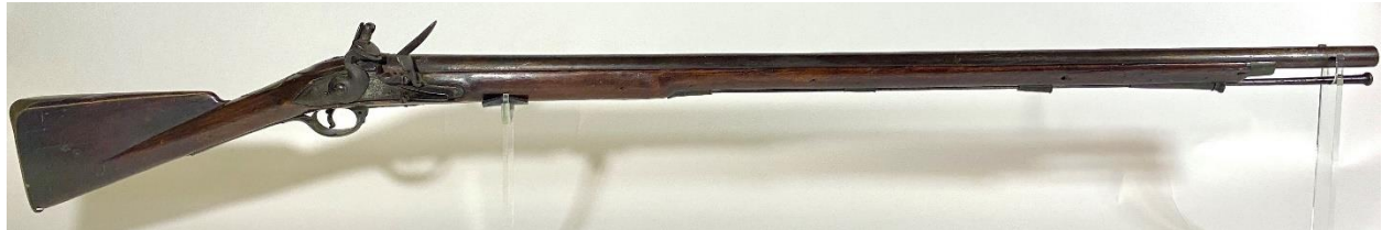
British Issued English Short-Land Musket British Army's Muzzle-loading Smoothbore Flintlock